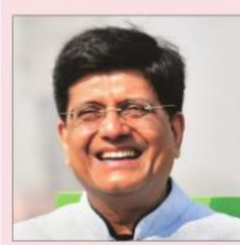
Commerce and industry minister Piyush Goyal

According to the data compiled by the Department for Promotion of Industry and Internal Trade (DPIIT), about 12% of the startups belong to the IT services, 9% to healthcare and life sciences, 7% to